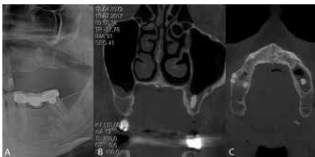
Figure 3. A. Panoramic radiograph showing tooth root displaced into the maxillary sinus. B. CBCT scan demonstrating the displacement of the tooth root into the maxillary sinus, coronal view. C. CBCT scan demonstrating the displacement of the tooth root into the maxillary sinus, axial view.

Luc access bilaterally and the elevation of a trapezoidal full-thickness mucoperiosteal flap. The buccal aspect of the flap was raised to access the maxillary sinus bony wall. The rectangular bone window was removed with the help of piezo-surgery (Figure 4A). The sinus membrane is perforated and the root is reached. (Figure 4B) L-PRF was applied to the surgery area and the removed bone piece was fixed with the aid of a mini screw (Figure 4C-4D). Postoperatively, amoxicillin 1000mg, naproxen 550mg, cetirizine 5mg, pseudoephedrine 125mg, % 0,12 chlorhexidine mouth rinse twice a day were prescribed for a week. The postoperative course was uneventful and the patient was asymptomatic in the three months period of follow-up.